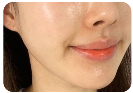
AFTER Microneedling and topical Exomide. Result after 1 session of treatment.