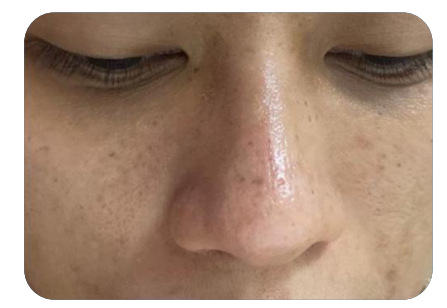
AFTER Microneedling and topical Exomide. Result after 1 session of treatment.